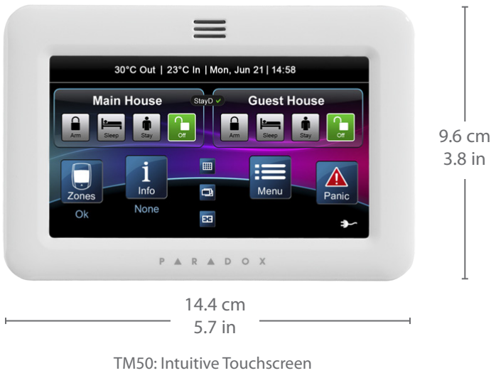
TM50: Intuitive Touchscreen